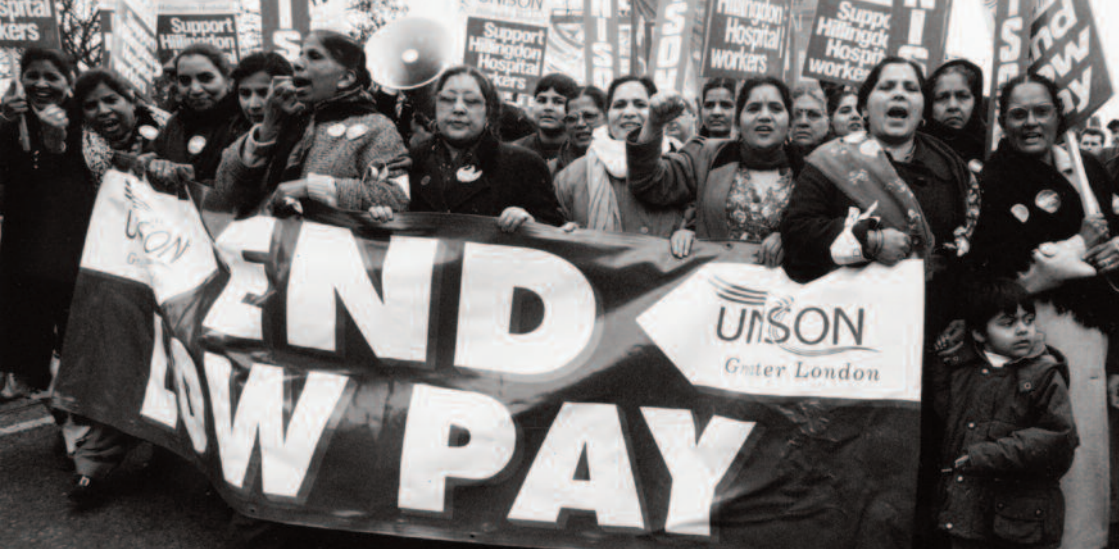
Five Today: women workers, women's rights, class, capitalism and the labour movement in the 21st century

'The feminisation of poverty' | The wages struggle | Black women | The women's movement today | Women and trade unions today |