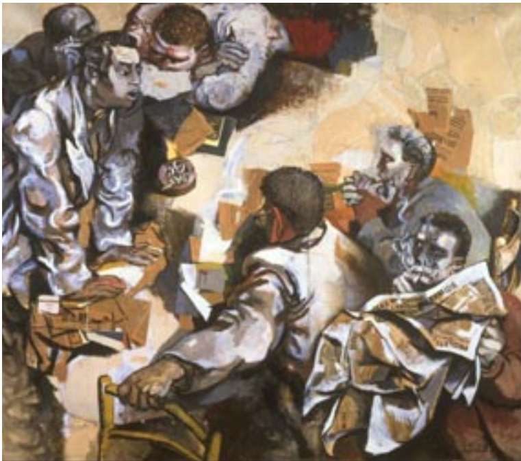
▲ La Discussione by Renato Guttuso 1960 ‘I was a child of ten or twelve years old and I remember, one evening, a procession with a red flag, the first red flag of my life.’ Guttuso on the birthday of the Sicilian poet Ignazio Buttitta